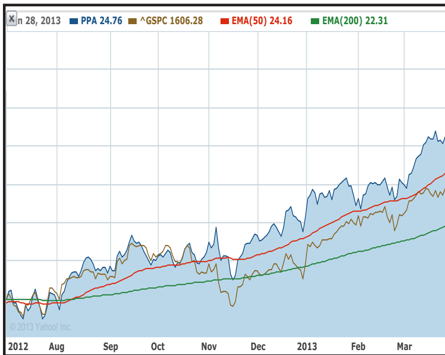
PPA (blue) 50-day MA (red) S&P500 (rust) 200-day MA (green)