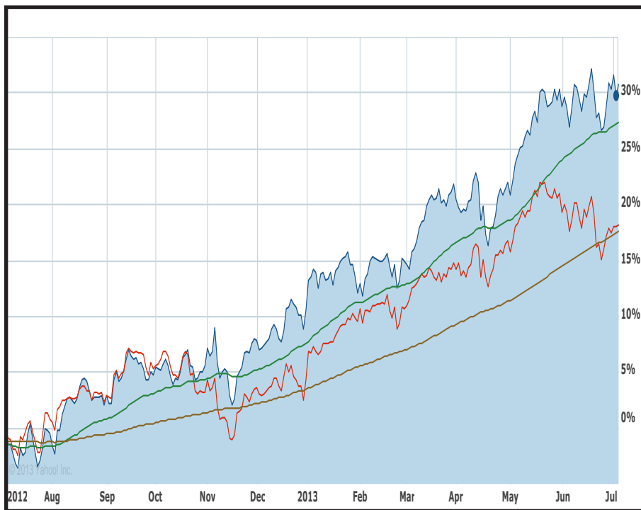
PPA (blue) 50-day MA (green) S&P500 (red) 200-day MA (brown)